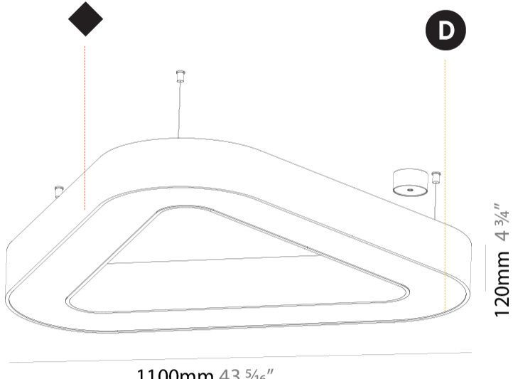
1100mm 43 5/16"